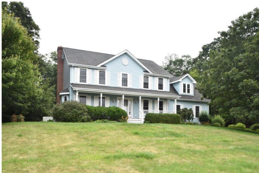
East Lyme, CT